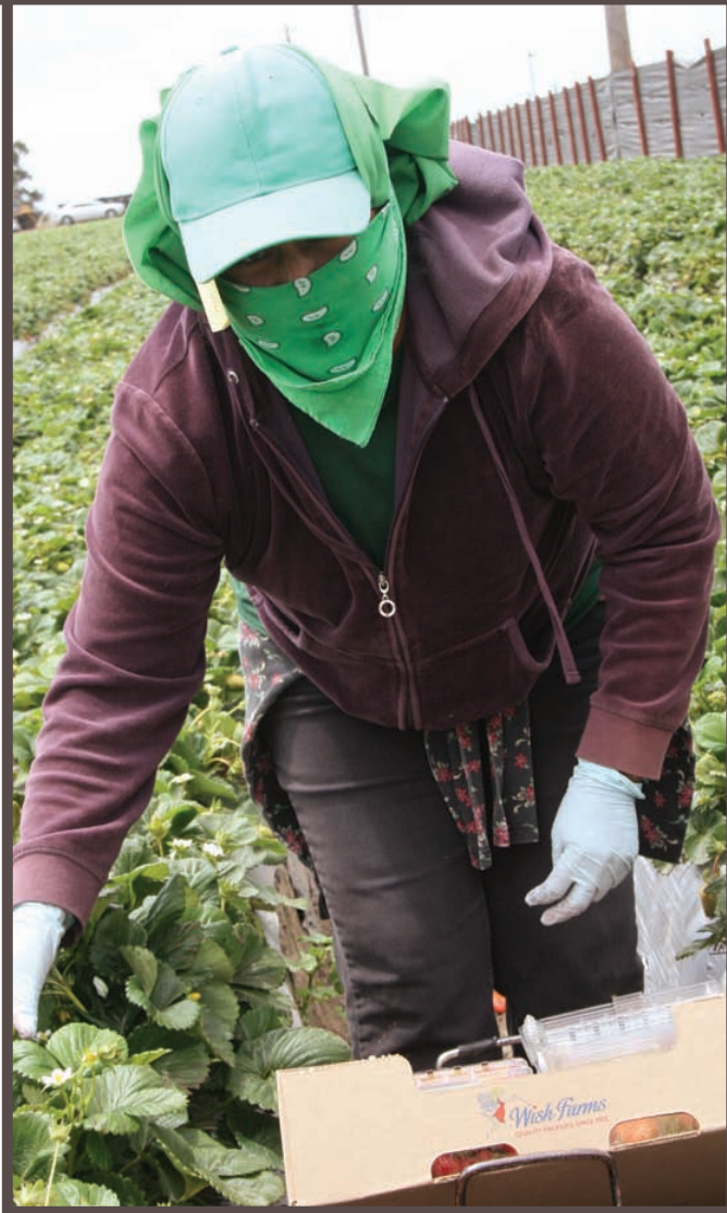
Women working in Salinas strawberry fields, covered in layers of clothing to protect against unwanted attention.

"I kept quiet for a long time," she says in Spanish, explaining how she was afraid to speak out—afraid her supervisor might hurt her more, afraid no one would believe her, afraid of losing her job. As a single mother raising three young daughters on her own, she desperately needed the income to survive. But the abuse continued until she couldn't take it anymore.