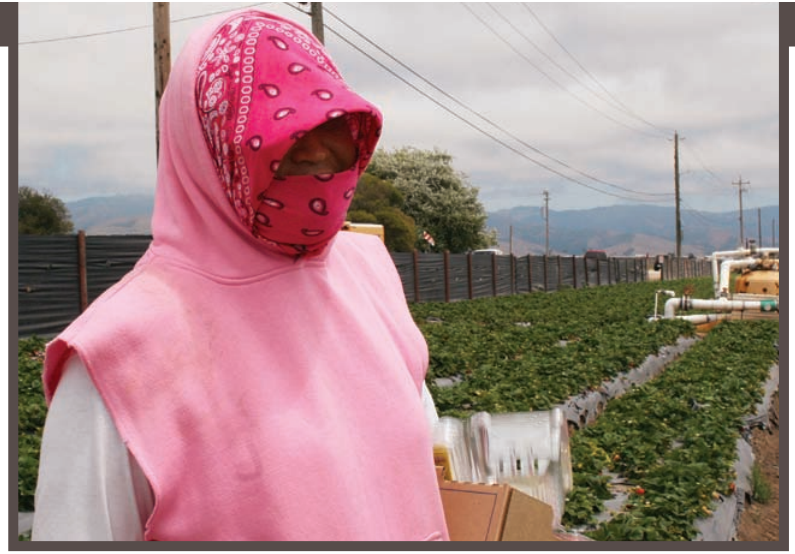
The Bandana Project protests the danger of assault for women who work in the agricultural industry.